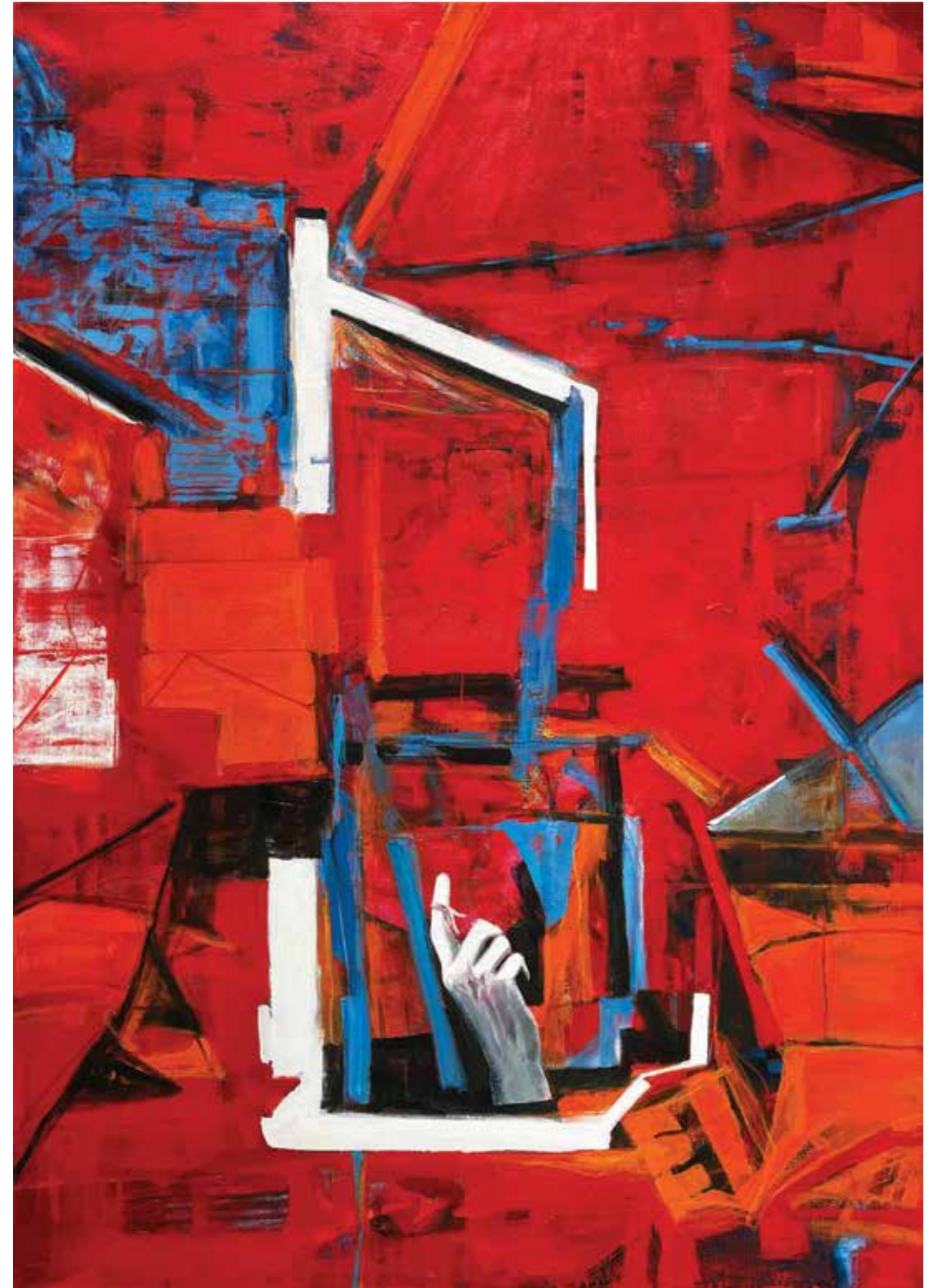
I remember you from tomorrow - 3 , 173cm x 122cm (68"x 48"), Oil on Canvas, 2023.

'I remember you from tomorrow,' posits itself within the meta-modern framework, where Ratnadeep assumes the role of the creator and summoner, bringing together images and objects into the material, and here, the viewer dauns the role of the participant and interpreter.