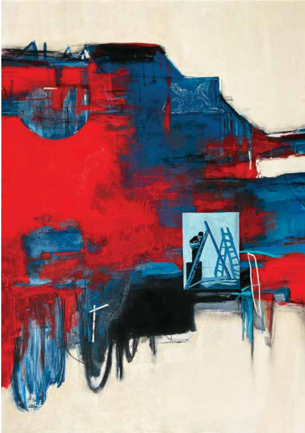
I remember you from tomorrow - 7, 173cm x 122cm (68"x 48"), Oil on Canvas, 2024.

I remember you from tomorrow. Loitering around the ruins is allowed. I remember you from tomorrow Only the Self exists. Life is the endless play of the Self losing itself only to find itself again in a constant game of hide-and-seek. I remember you from tomorrow. My own consciousness is the only element of existence I am personally aware of. Through the flow of subjective experiences I perceive an external reality and myself demarcated from it... I assume that other human minds—and to some extent non-human minds—experience a similar structure in this eternal moment of "now." I remember you from tomorrow There is nothing more abstract and also concrete than concept of time. Seeing continued timeline right from history to future and how closer to timeline our perspective of events and being further away the difference of change. I remember you from tomorrow Considering two people started in same time but if it reacts differently that means the 'time' force is not common and is variable! I remember you from tomorrow The source of everything that exists, and in which the memory of the cosmos is encoded. I remember you from tomorrow To perceive the notion of reality in abstract world.