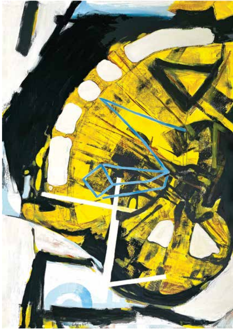
I remember you from tomorrow -1, 173cm x 122cm (68"x 48"), Oil on Canvas, 2023.