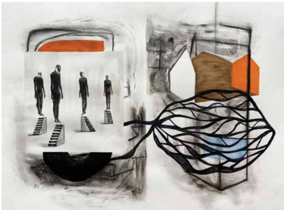
Above & adjacent page detail: Untitled, 56cm x 76cm (20"x 30"), Charcoal, acrylic on paper, 2024.