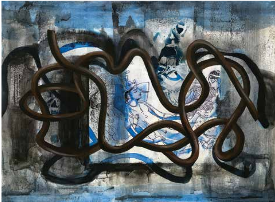
Untitled, 56cm x 76cm (20"x 30"), Charcoal, acrylic on paper, 2024.