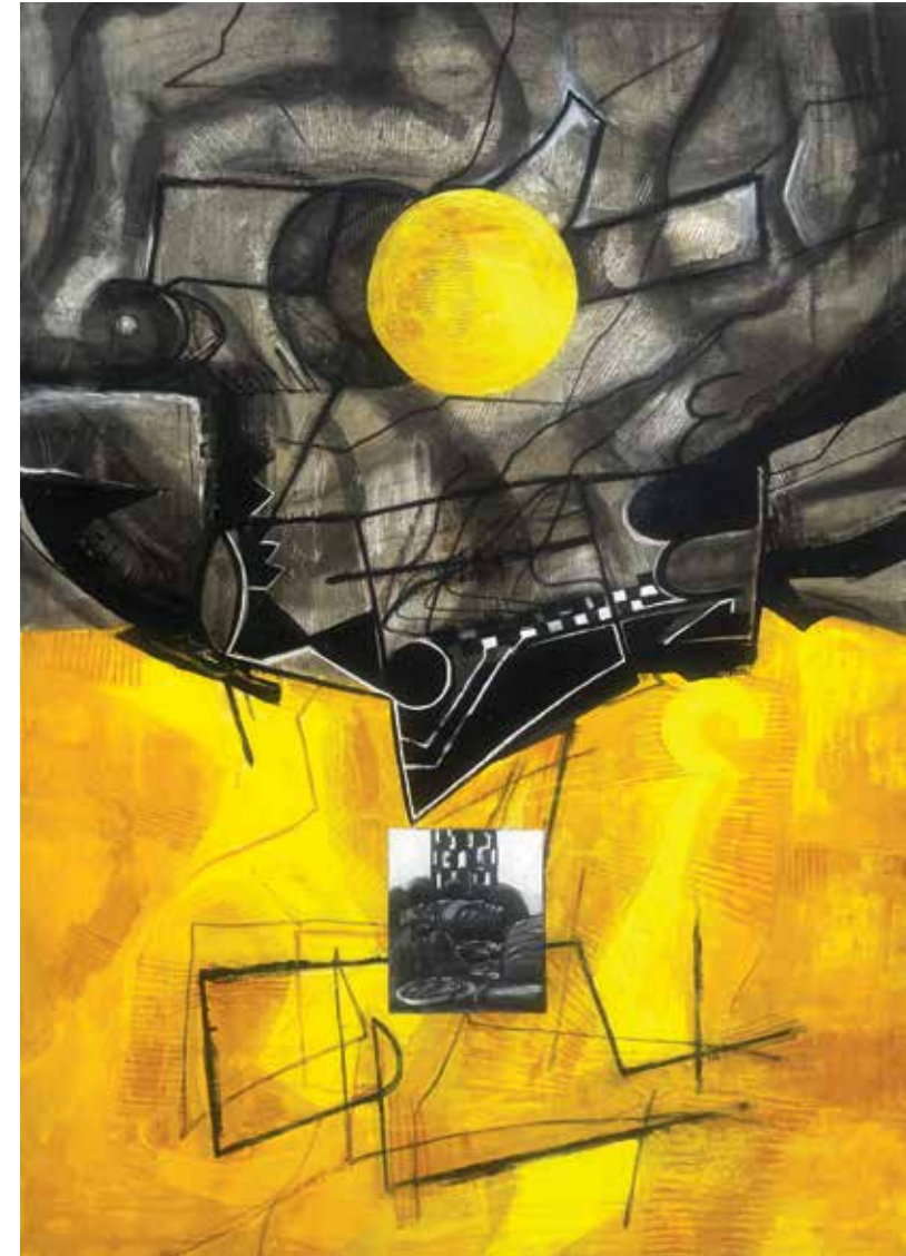
I remember you from tomorrow - 4, 173cm x 122cm (68"x 48"), Oil on Canvas, 2023.

His works and methodology merge abstraction and figuration through a richly coloured, illustrative style. Vibrant, discordant palettes and off-kilter compositions evoke emotional intensity and complexity, while the balance between chaos and order reflects a dynamic tension.